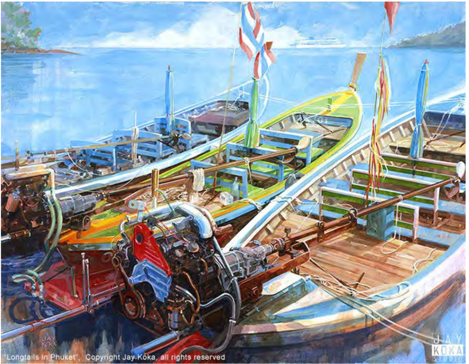
"Longtails in Phuket"

I continue my travels and very much look forward to my return visit to Egypt in 2022. While recognizing that so many have suffered, I am grateful that the COVID pandemic hasn't impacted my family directly. But I confess, our inability to travel has been painful!